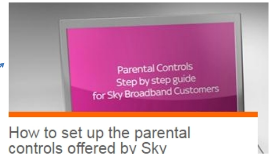
How to set up the parental controls offered by Sky