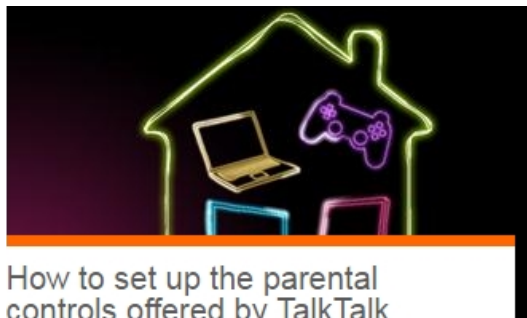
How to set up the parental controls offered by TalkTalk