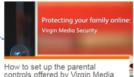
How to set up the parental controls offered by Virgin Media

Click the images for a link to video tutorials