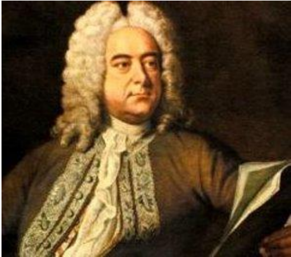
George Fredric Handel 1685-1759